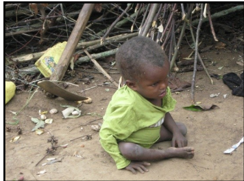
Hands of Mercy Orphans and Vulnerable Children Program provides care for the most at risk.