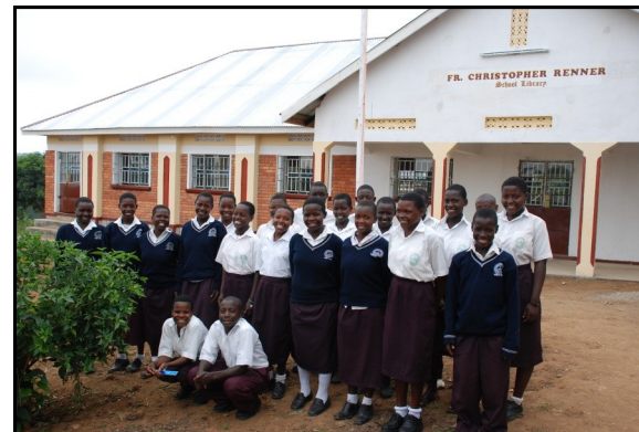
Some of the fortunate students in front of the St. Denis school in Makondo.