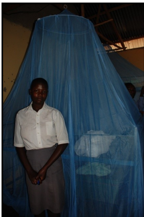
Bunk beds and bed nets provided through the Hands at Work Program .