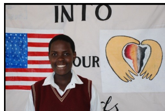
Hands of Hope Scholarship Recipient.